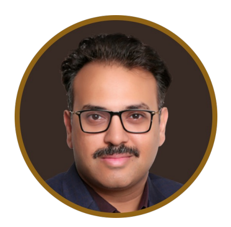
CEO, PMS AIF World